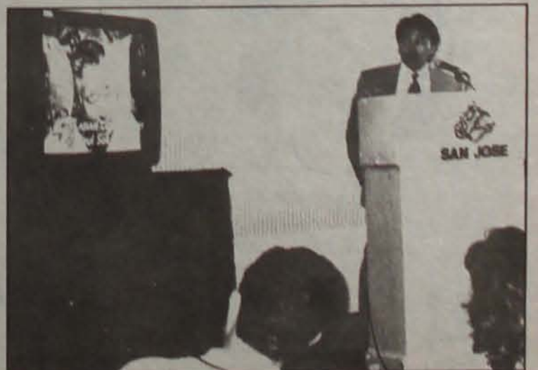
HIGH-TECH —The convention featured for the first the use of TV screens and other equipment to ensure an efficient and smooth-running convention.