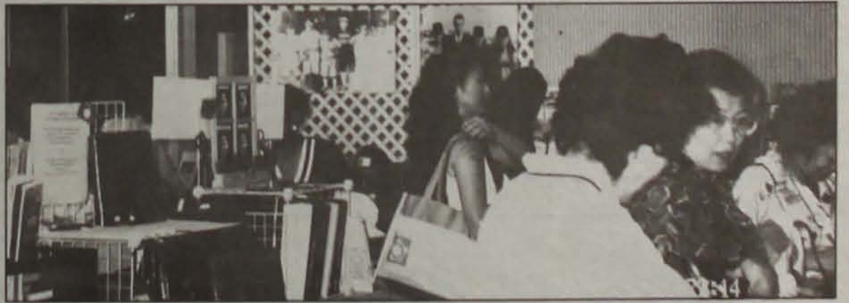
EXHIBITS —JACL members were able to browse, mingle and view a number of historical and informational booths such as this one at the Fairmont Hotel in San Jose.