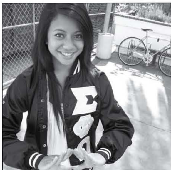
Sigma Phi Omega at San Diego State is about unity according to members like Gomez.

But unlike other Asian-interest fraternities and sororities at the time, he wanted to es-