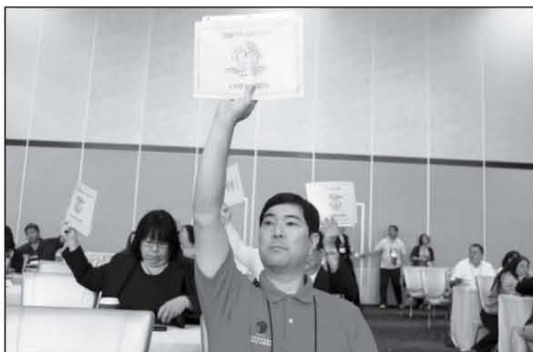
JACL delegates vote during the business session of the recent 42nd national convention in Los Angeles.

I was curious to see how many pages all together were filed on the one CD distributed to chapter delegates and convention leaders at the recent 42nd National JACL Convention. This is a very "go green" future for JACL conventions, national or district.