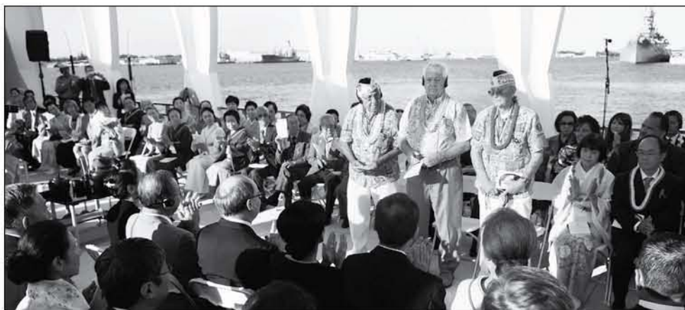
At the tea ceremony, attendees honored Pearl Harbor survivors (top) while Japanese guests (right) listened to an interpreter. The ceremony was held in the spirit of respect, reconciliation and peace.

Urasenke School of Tea grand tea master Genshitsu Sen, who served in the Japanese naval air force during World War II, prepared two bowls of green tea — one each for Pearl Harbor war dead and world peace. He took the bowls to the memorial's shrine room,