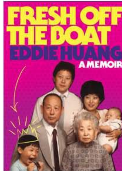
ABC's "Fresh Off the Boat" is based on Eddie Huang's 2013 memoir.

"Fresh Off the Boat" is far from perfect. But if the Huang's financially embattled, quaint and sometimes stereotypical household must serve as a noncontroversial foil on the path toward airing the more complicated, real-to-life stories of our families, we could honestly be a lot worse off.