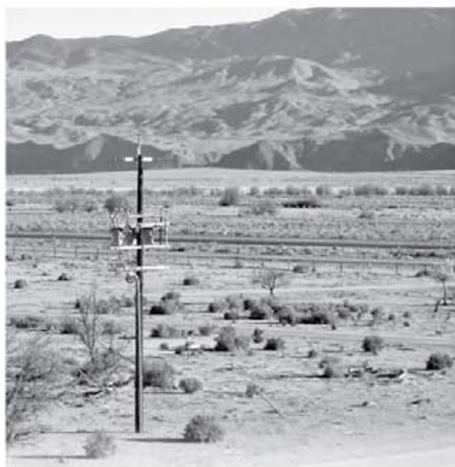
A view looking east from the visitor's center at Manzanar National Historic Site. The floor of the Owens Valley, along with the Inyo Mountains in the background, are visible. But this view could be destroyed by a massive solar energy generating station, proposed by the Los Angeles Department of Water and Power.

For reference, the Manzanar Committee's full comments on the draft PEIR that were submitted to Inyo County are available at http://blog.manzanarcommittee.org/2015/02/03/inyopeircomments .