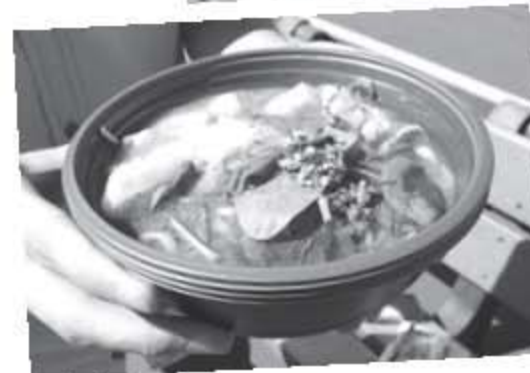
(Above) Osaka Ramen Collabo's pork and seafood ramen was a fan favorite this year.