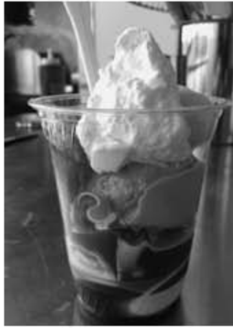
(Above) Matcha Parfait made with layers on layers of homemade goodness.

'Whatever blessings we receive, we want to impart that on others.'