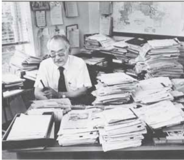
Min Yasui in his CCR office