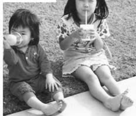
(Above) A moment captured almost 15 years ago of the brother-sister duo.