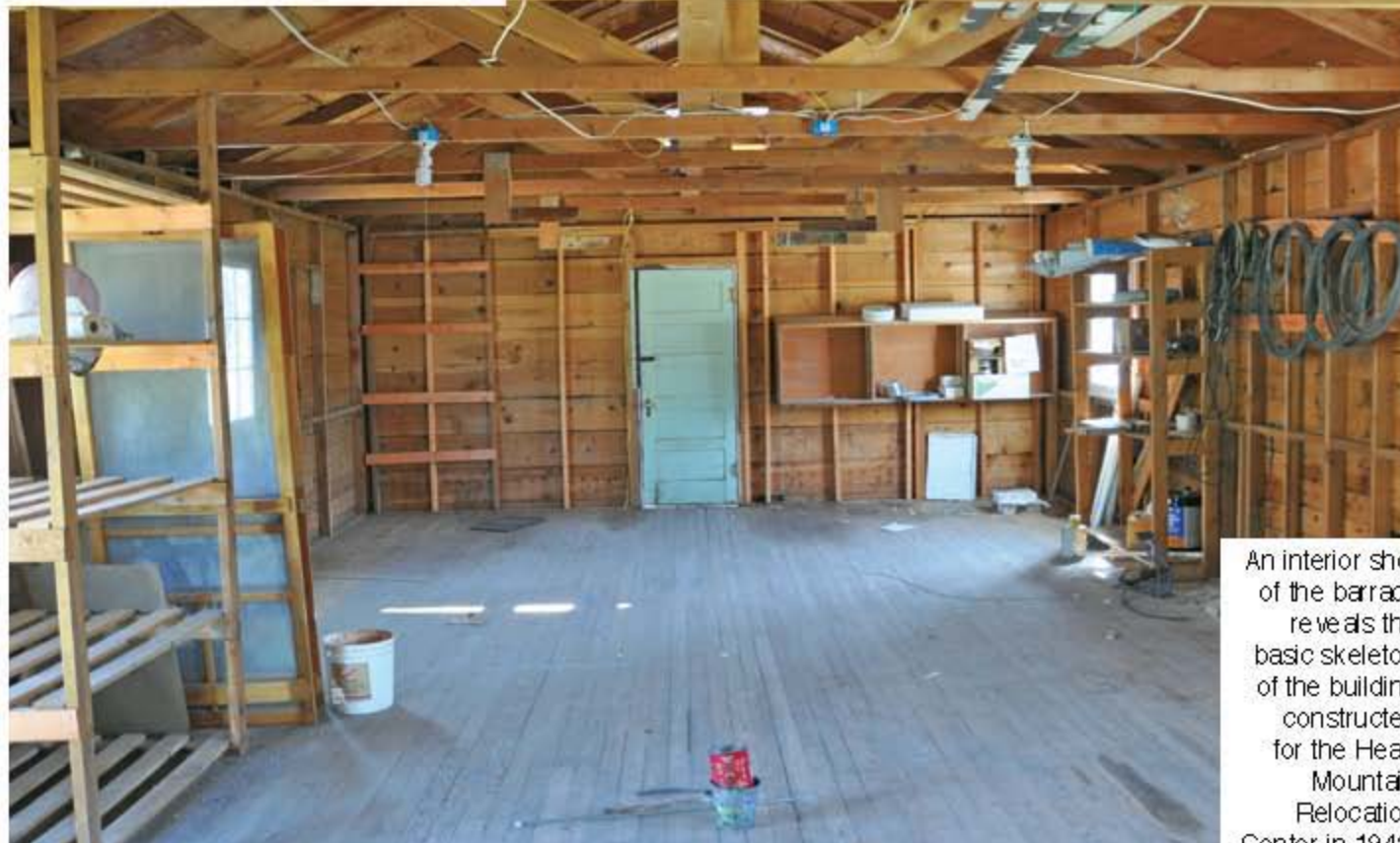
An interior shot of the barrack reveals the basic skeleton of the building constructed for the Heart Mountain Relocation Center in 1942.