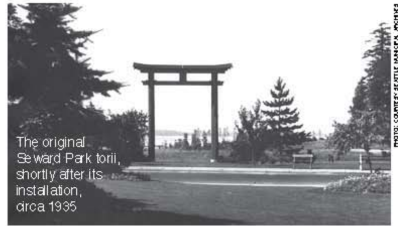
The original Seward Park torii, shortly after its installation, circa 1935

After the celebration, the torii was disassembled and donated to the city where it was placed in Seward Park's north side. The famous floating torii offshore from Itsukushima Shrine in Miyajima, Japan inspired the Seward Park design, which was sketched by