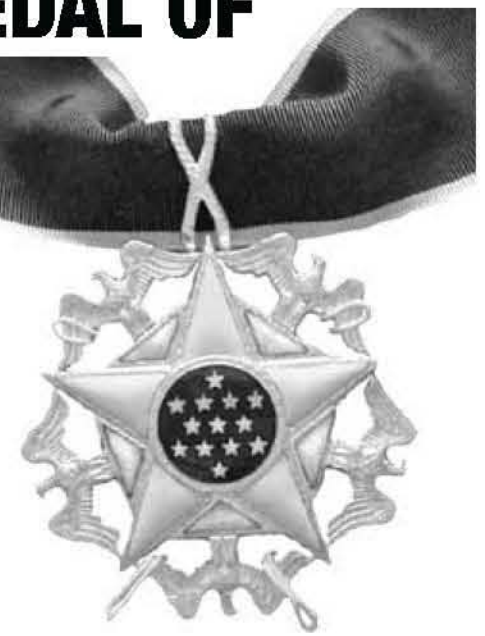
The Presidential Medal of Freedom

For more than a century, the Oregon His-