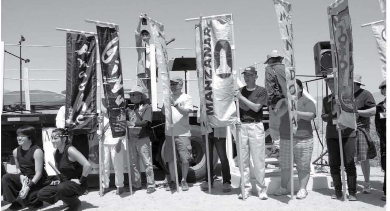
The traditional role call of camps is an annual tradition during the Manzanar Pilgrimage.