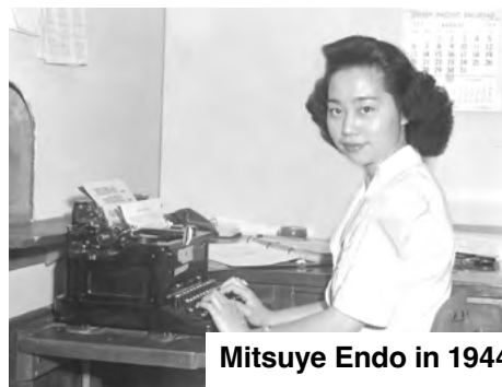
Mitsue Endo in 1944

The JACL’s statement may be read at https://jacl.org/statements/jacl-celebrates-announcement-of-mitsue-endo-presidential-citizens-medal . ■