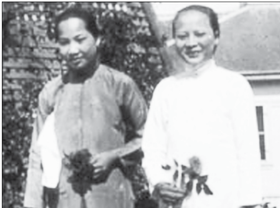
The Chinese Exclusion Laws placed increasing restrictions on Chinese immigration.

The group is seeking recognition by the U.S. government, which passed the Chinese Exclusion Act in 1882.