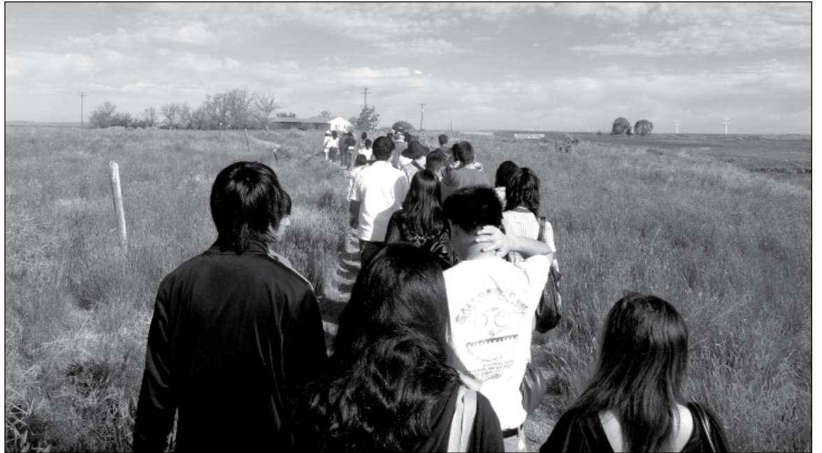
Every year, the Minidoka Pilgrimage attracts hundreds of visitors to learn more about the site's WWII history.