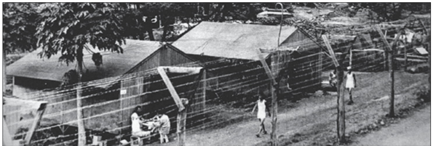
During World War II, Honouliuli held about 3,000 Japanese Americans.

The service plans to evaluate the significance of the sites and consider a range of preservation alternatives. ■